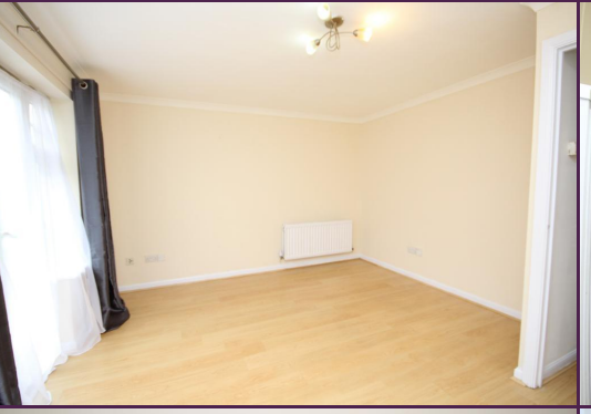
£1,540 per month TO RENT

Council tax band: D Tenure: Assured Shorthold Tenancy